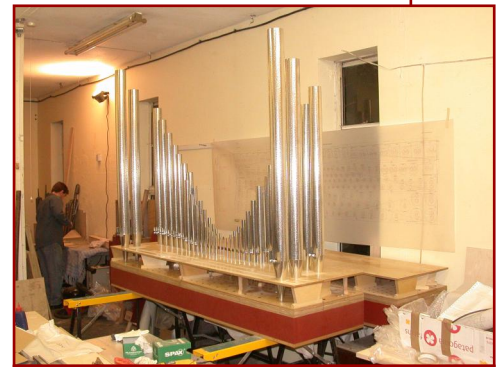
Chests in Workshop

On Sunday 10th December 2006 the organ was blessed during a packed commemoration service led by the Bishop of Hong Kong and the congregation heard pipes speak that had last been heard 50 years earlier.