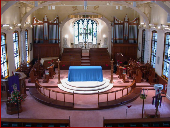
Inside St Paul's Church

The organ in the parish church of St Paul's in Hong Kong had lain disused since it was damaged during the Second World War. Unable to have the entire instrument restored, the church had much of the pipework removed, leaving only the front pipes and casework, with the lower half of the casework turned into a music library.