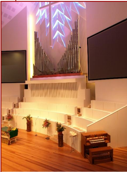
New Organ