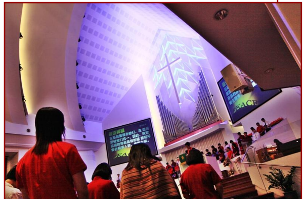
Congregation at worship

The organ integrates fully with the church's lively worship ministry, which includes all expressions of music from the choirs, and classical instrumentalists, through to contemporary music.